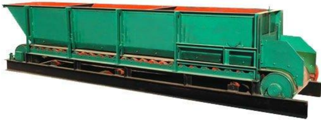
Double shaft mixer: